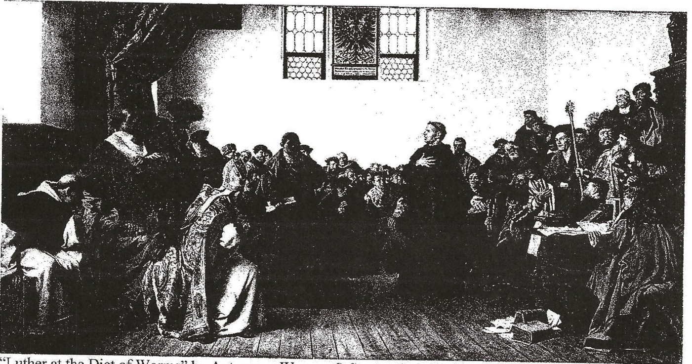
“Luther at the Diet of Worms” by Anton von Werner.

On April 18, 1521, three and a half years after he nailed the 95 Theses to the church door in Wittenberg, Martin Luther made his historic stand at the Diet (official meeting) in the German city of Worms (pronounced “Vorms”). Accused of fostering heresy, he was directed by Charles V and other leaders to recant his teaching about the pure Gospel or face death.